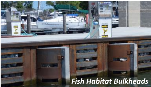
Fish Habitat Bulkheads