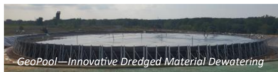
GeoPool—Innovative Dredged Material Dewatering

We embody innovation. We've implemented several first-of-its-kind projects. Our people are active in professional associations, research, and working groups.