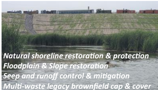
Natural shoreline restoration & protection Floodplain & Slope restoration Seep and runoff control & mitigation Multi-waste legacy brownfield cap & cover