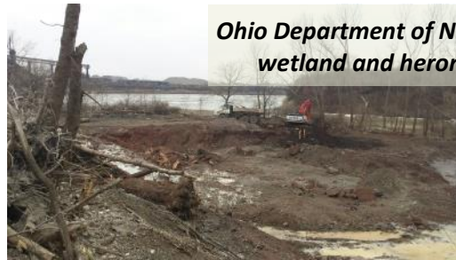
Ohio Department of Natural Resources-funded wetland and heron rookery restoration

SUSTAINABLE SOLUTIONS FOR YOUR WATER RESOURCES