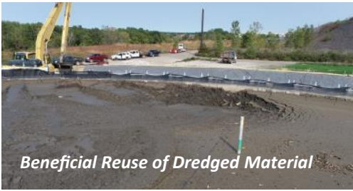
Beneficial Reuse of Dredged Material