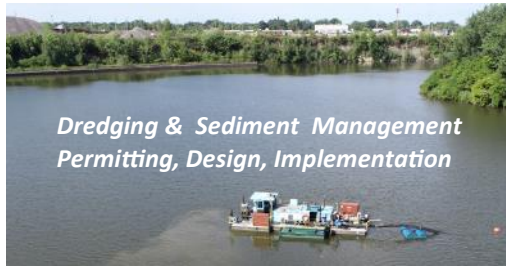
Dredging & Sediment Management Permitting, Design, Implementation