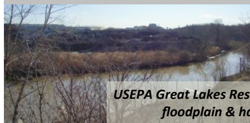
USEPA Great Lakes Restoration Initiative-funded floodplain & habitat restoration